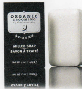
Organic Grooming Dusk Scent Milled Soap

He may give you an awkward glance when he first opens the package, but really, you can't get more manly when it comes to grooming than with a company called Herban Cowboy .